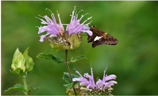
[Photo of Silver-spotted Skipper in the Black Hill Visitor Center Gardens]

Your privacy is important to us. We will not distribute any information about you, without your permission.