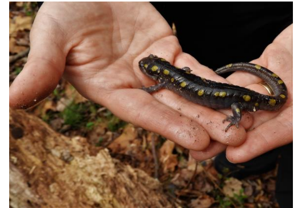
[Top Photo: Great Blue Heron on Little Seneca Lake] [Bottom Photo: Salamander in Montgomery Co]

of Black Hill Nature Programs promote, support, and sustain the nature programs and special events at the Black Hill Regional Park in Boyd's, MD.