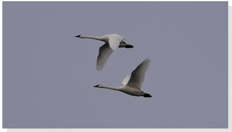
Tundra Swans flying over Little Lake Seneca.

Website: https://www.friendsofblackhillnature.org